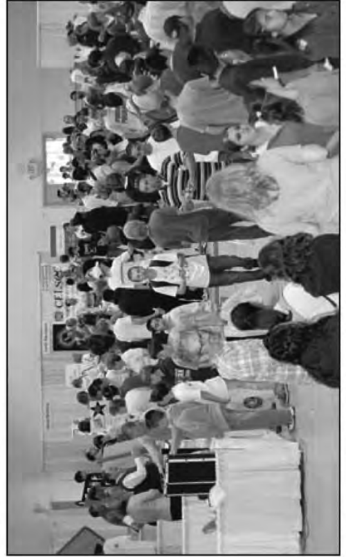
NCBE's Careers in Construction EXPO attracts over 1,000 students every year.

In the past five years alone, NCBE has funded over $150,000 in grants to middle and high school construction related programs. From standard wood and metal shops to drafting, green building and construction technology classes, these grants have helped school programs by providing them with money