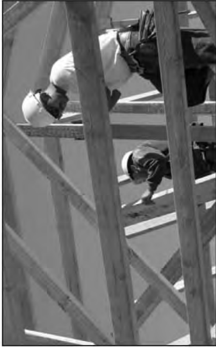
Members of the North Coast Builders Exchange play vital roles in supporting their communities.

Commitment to our communities can be seen in so many ways, including community celebrations. NCBE's support of 4th of July Celebrations throughout the region speaks volumes to the impact the building industry plays in the quality of life for North Bay residents.